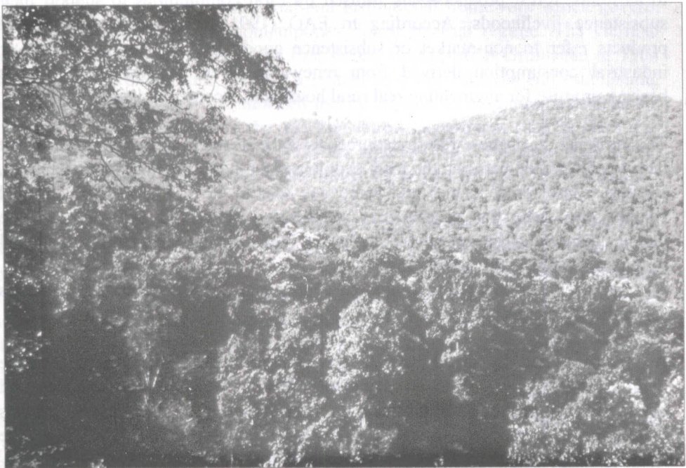
Fig. 2: The high canopy forests in Tanzania

Since these forestlands are spatially isolated from each other, they have a very diverse flora and fauna. As a genetic resource, these high canopy forests contain more species than any other ecosystem (Lovett 1985). The Tanzania high canopy forests are characterized by the plants' competition for light compared to other ecosystems. The resultant structure is the creation of layering or vertical structure, whereby the topmost layer is the emergent trees followed by a continuous canopy which tends to restrict sunlight to reach layers below it, making them permanently under shade. Given sporadic windthrows, a process called phytoturbation, gaps are created in the canopy which influence the horizontal structure facilitating seedlings and saplings of the middle storey and canopy trees, shrubs and herbs to colonise the areas (Figure 2). Species of fully vertically structured forest are the primary species; and the light demanding, fast-growing colonising species, are called secondary species. The Tanzania high canopy forests characterised by a high level of endemism are hence a dynamic ecosystem.