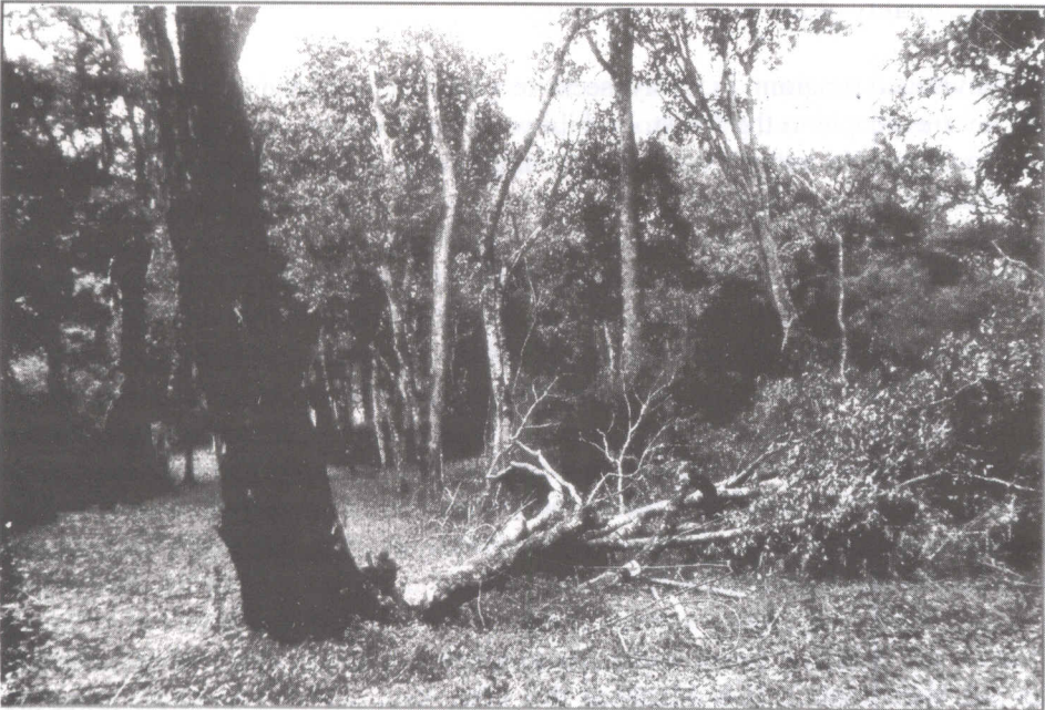
Figure 3: Degradation of forest resources

Second, are the private forest reserves and plantations. These forestlands are owned and exploited by independent educational and commercial institutions. They were reported to be under strict control and efficient management. The third are the local authority forest reserves. These reserves are under the management of the local government at district level. Under this resource use system, communities within the vicinity of the reserves have access to some forest resources. Local people have access to forestland for subsistence and cash crops production. Smallholder farmers clear part of the forestland for growing crops such as maize, beans, cardamom; collect fuelwood, building materials, fodder, fruits and vegetables. Incidentally, the regulation of community access to the resources, in terms of rural land use planning, has not been efficient enough to sustain and/or promote the productivity of the forestlands. This state of affairs has resulted in forest resource degradation (Figure 3) that underlies environmental degradation, triggers human-induced disasters, and exacerbates rural poverty.