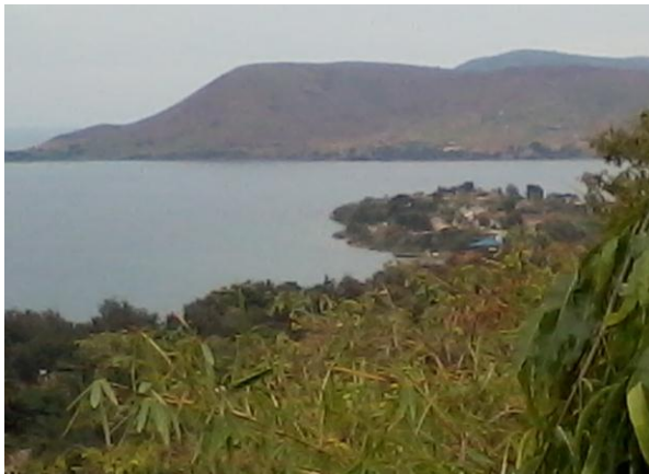
Shores of Lake Tanganyika, Kigoma

Local Government Authorities (LGAs) are responsible for the provision of wide-ranging public services including environmental protection, forest conservation and community development, among others. But the key challenge for such incentives is governance.