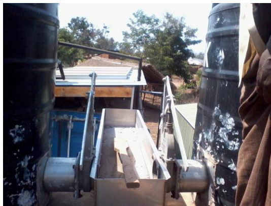
Alternative source of power, REDD project in Kigoma

Project title: The role of local government in implementing REDD